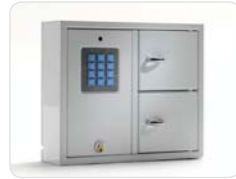
9002 B KeyBox in the Basic series with 2 doors and 16 key hooks (8 key hooks in each door). Exterior dimensions: 350x280x85 mm. Weight: 5.3 Kg