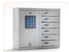
9006 B KeyBox in the Basic series with 6 smaller compartments. Exterior dimensions: 350x280x85 mm. Weight: 5.3 Kg