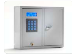
9001 S KeyBox in the System series with 1 door and 29 key hooks. Exterior dimensions: 350x280x85 mm. Weight: 6.0 Kg