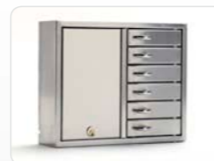
9006 E Stainless Stainless steel KeyBox in the Expansion series with 6 smaller compartments. Exterior dimensions: 350x280x85 mm. Weight: 4.3 Kg