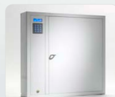
9500 S KeyBox in the System series with 1 door and 216 key hooks. Exterior dimensions: 746x730x140 mm. Weight: 28 Kg