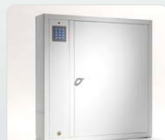
9500 B KeyBox in the Basic series with 1 door and 216 key hooks. Exterior dimensions: 746x730x140 mm. Weight: 27 Kg