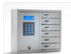
9006 S KeyBox in the System series with 6 smaller compartments. Exterior dimensions: 350x280x85 mm. Weight: 6.0 Kg