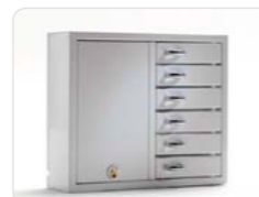
9006 E KeyBox in the Expansion series with 6 smaller compartments. Exterior dimensions: 350x280x85 mm. Weight: 4.3 Kg