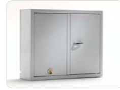
9001 E KeyBox in the Expansion series with 1 door and 29 key hooks. Exterior dimensions: 350x280x85 mm. Weight: 4.3 Kg