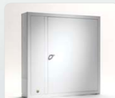
9500 E KeyBox in the Expansion series with 1 door and 216 key hooks. Exterior dimensions: 746x730x140 mm. Weight: 27 Kg