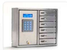
9006 S Stainless Stainless steel KeyBox in the System series with 6 smaller compartments. Exterior dimensions: 350x280x85 mm. Weight: 6.0 Kg