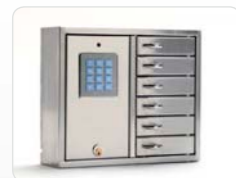
9006 B Stainless Stainless steel KeyBox in the Basic series with 6 smaller compartments. Exterior dimensions: 350x280x85 mm. Weight: 5.3 Kg