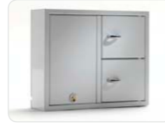
9002 E KeyBox in the Expansion series with 2 doors and 16 key hooks (8 key hooks in each door). Exterior dimensions: 350x280x85 mm. Weight: 4.3 Kg