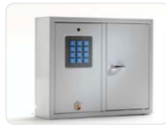
9001 B KeyBox in the Basic series with 1 door and 29 key hooks. Exterior dimensions: 350x280x85 mm. Weight: 5.3 Kg