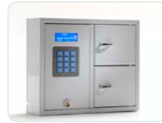
9002 S KeyBox in the System series with 2 doors and 16 key hooks (8 key hooks in each door). Exterior dimensions: 350x280x85 mm. Weight: 6.0 Kg